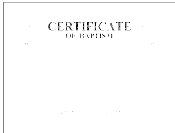
Bad Scan/Photo = Not Accepted

Once completing your Supplementary Information Form, please remember: